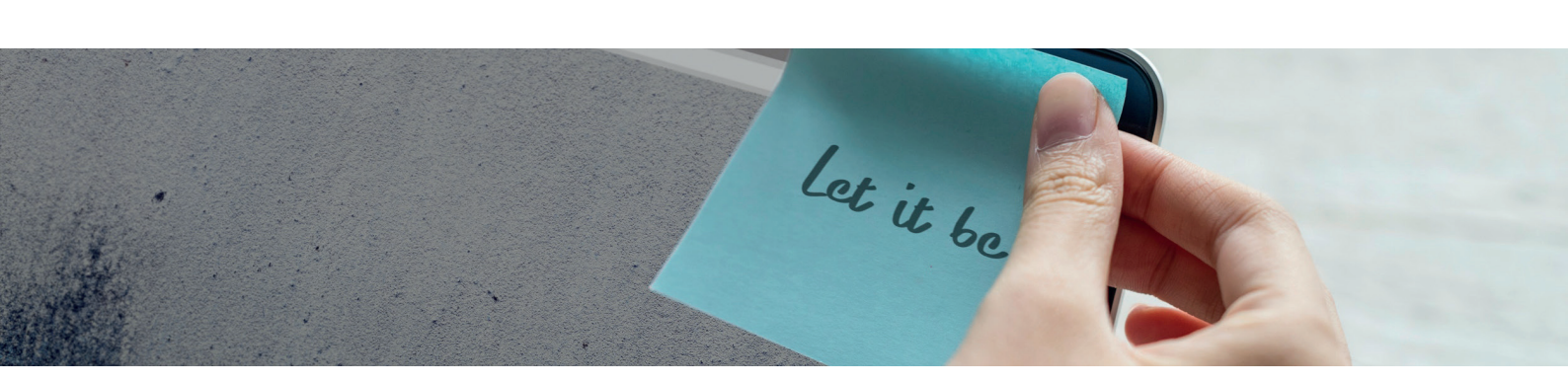
The European Commission support for the production of this publication does not constitute an endorsement of the contents which reflects the views only of the authors, and the Commission cannot be held responsible for any use which may be made of the information contained therein